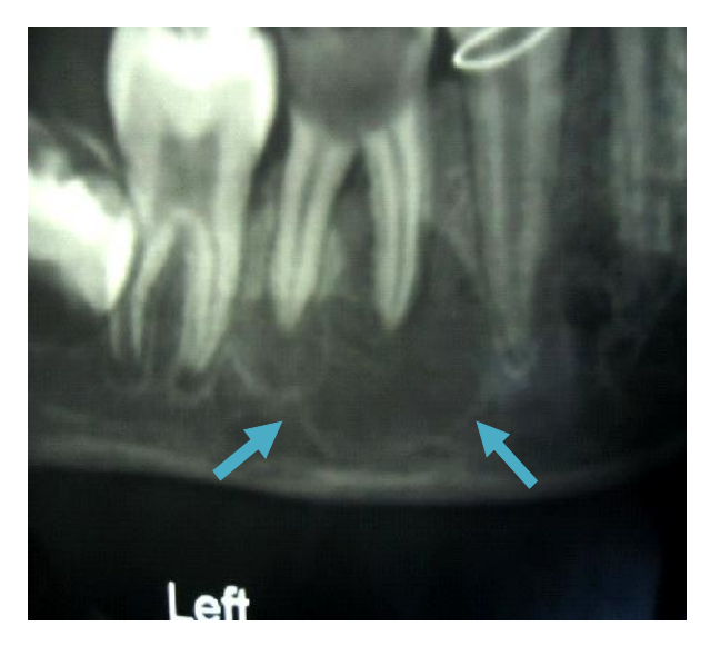
Figure 2: Extraoral radiographic view of same patient showing periapical lesion