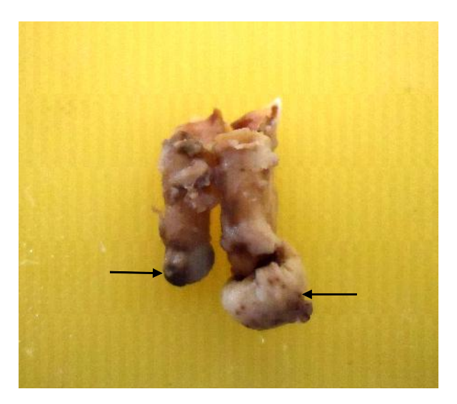
Figure 1: Grossly carious lower molar tooth of an eleven year old female with attached periapical lesion